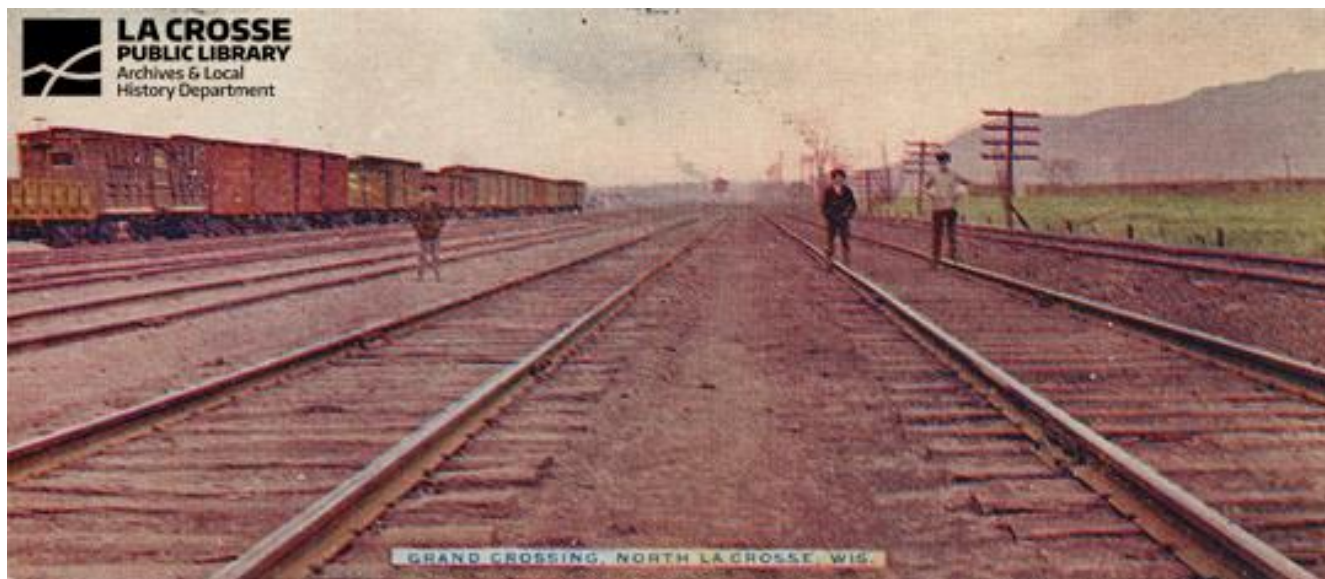
Grand Crossing in La Crosse, 1910 ca.