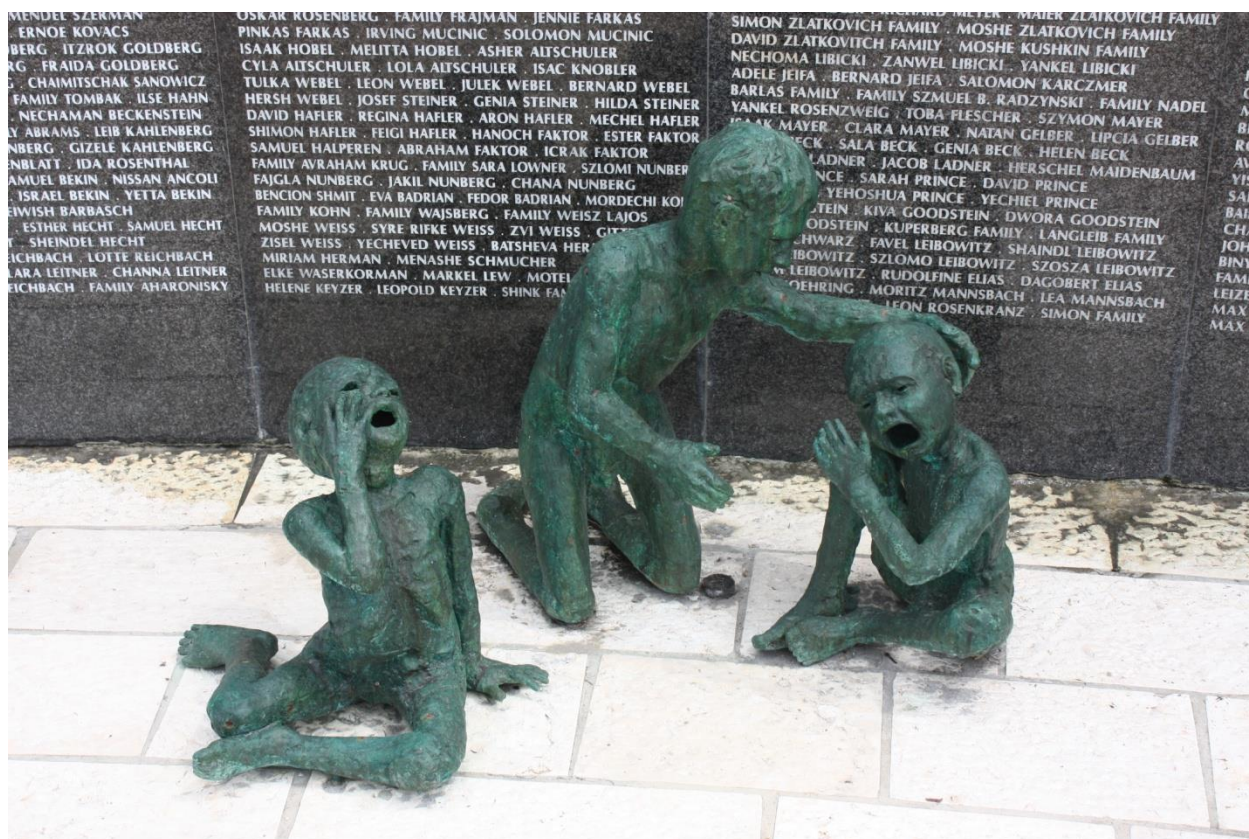
Holocaust Memorial, Miami, Florida

I recall one of my college history professors saying that his high school history teachers were World War II veterans, and "they showed us concentration camp films until we puked." They were just making sure the next generation would not forget what happened before them.