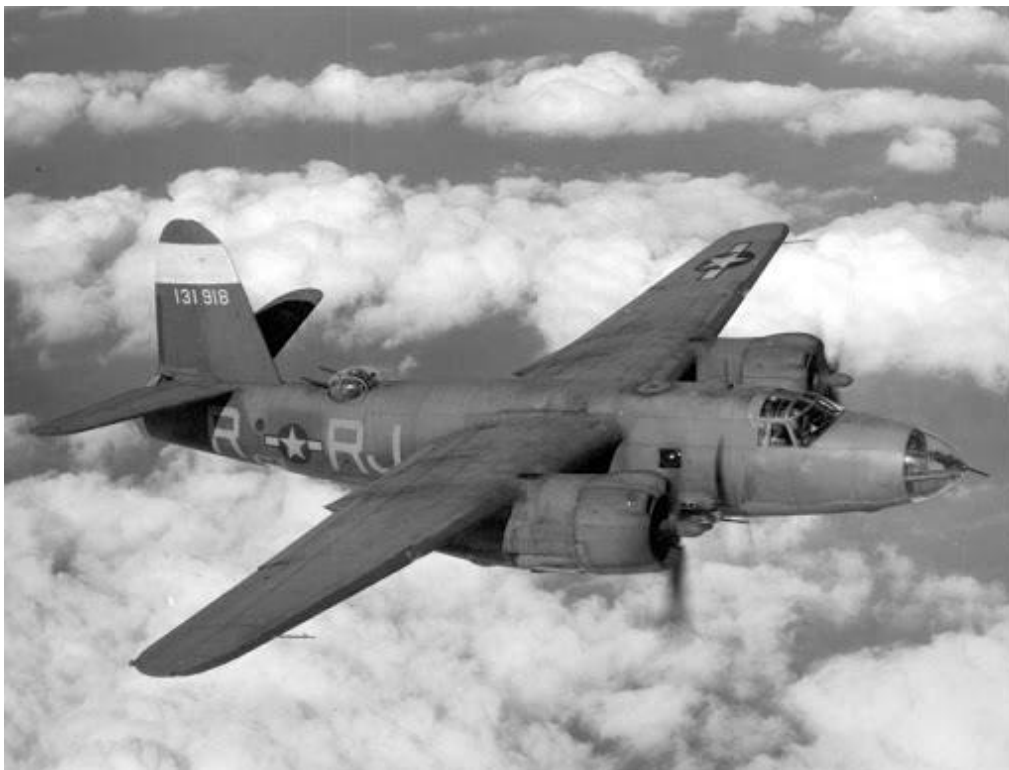
Martin B-26 Marauder bomber