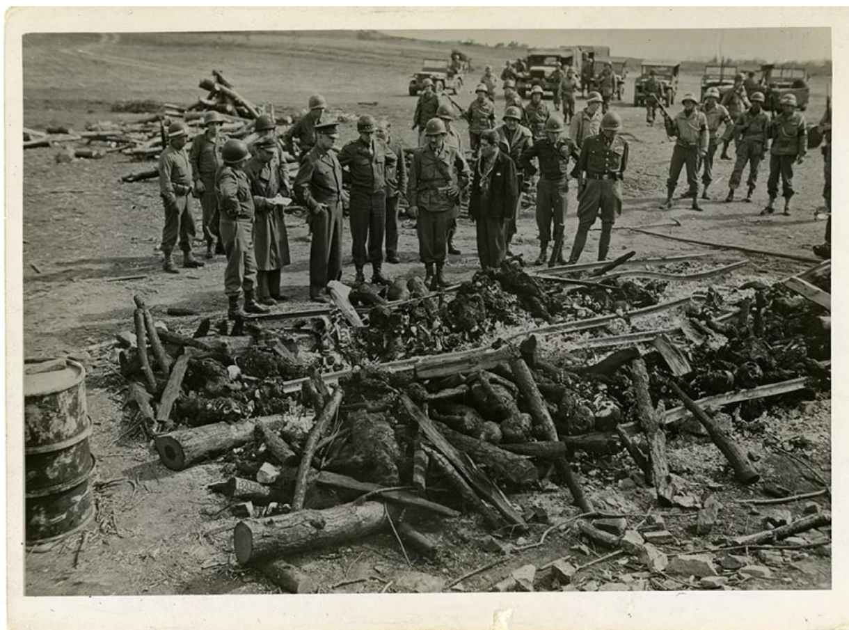
Generals Dwight D. Eisenhower, George S. Patton, and Omar Bradley view charred remains at Ohrdruf