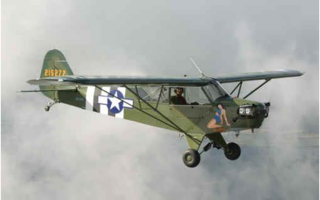
Piper L-4