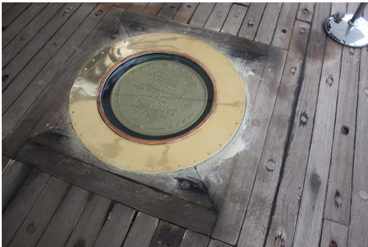
The place where World War II ended (Jeff Rand, 2018 September 2)