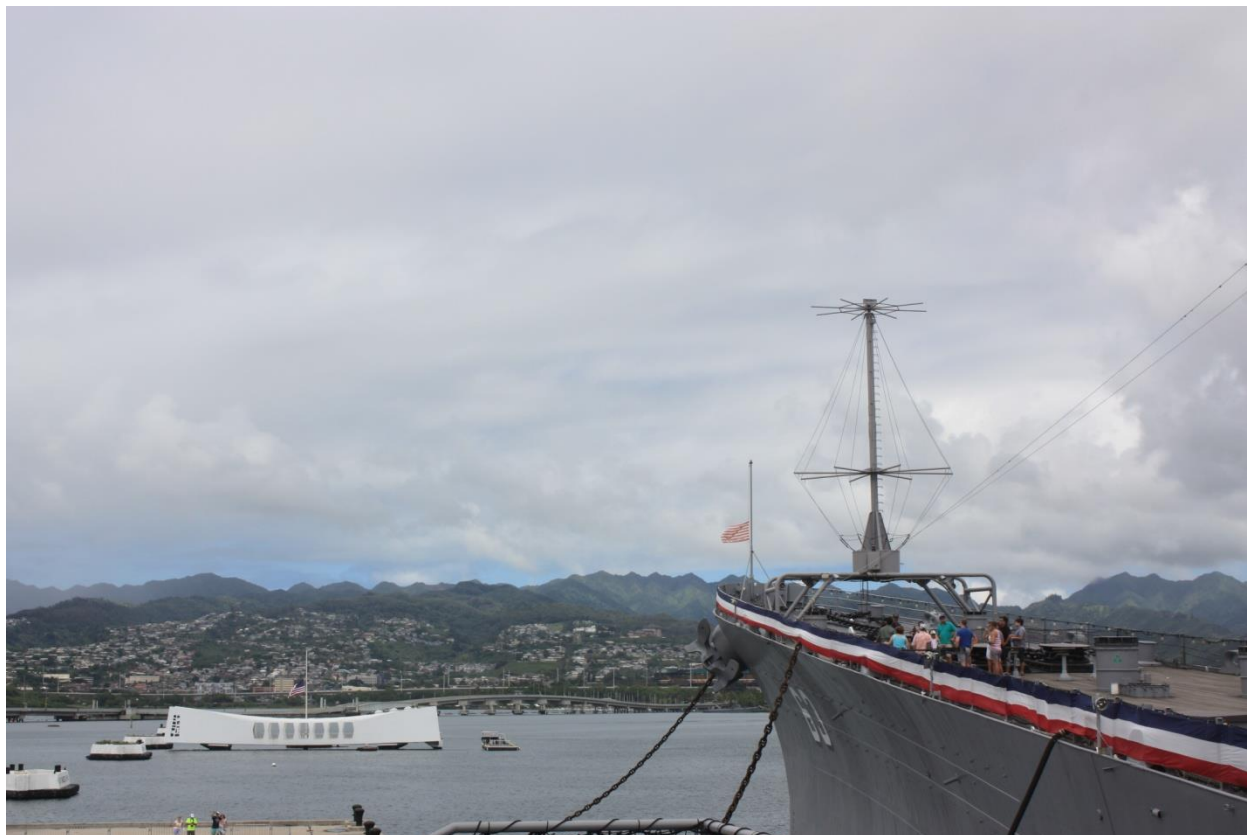
U.S.S. Arizona Memorial (left) and bow of the U.S.S. Missouri