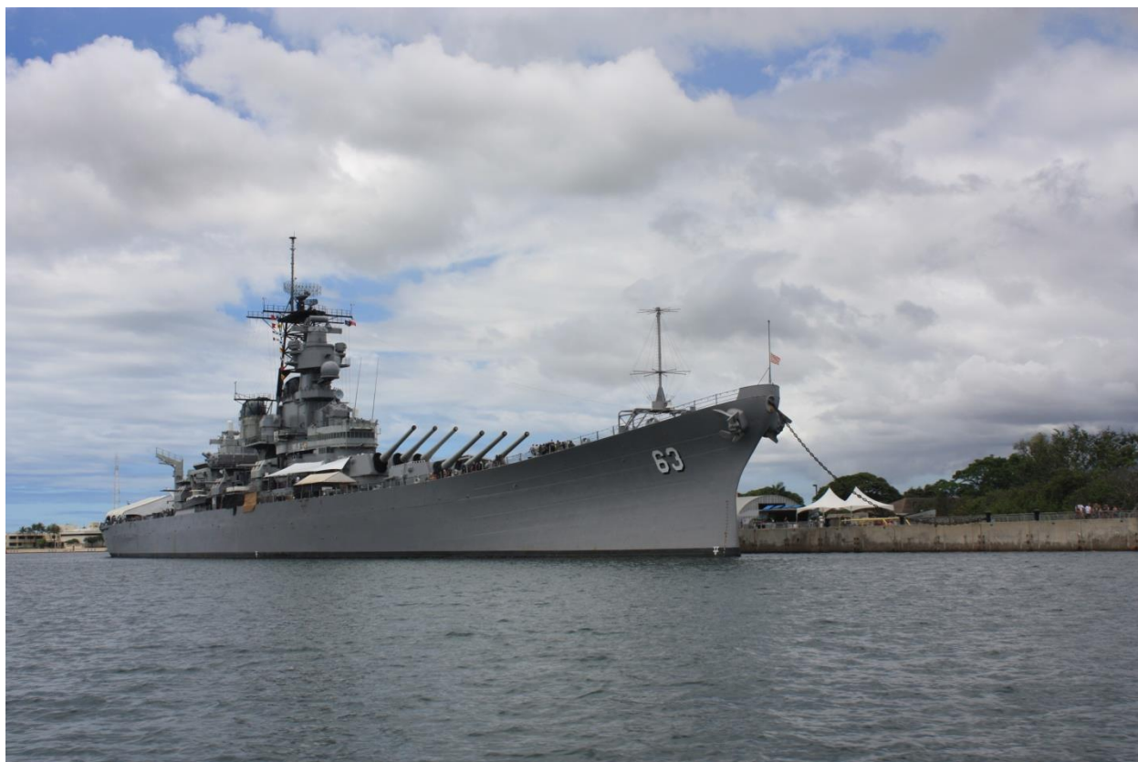
U.S.S. Missouri at Pearl Harbor, Hawaii (Jeff Rand, 2018 September 2)