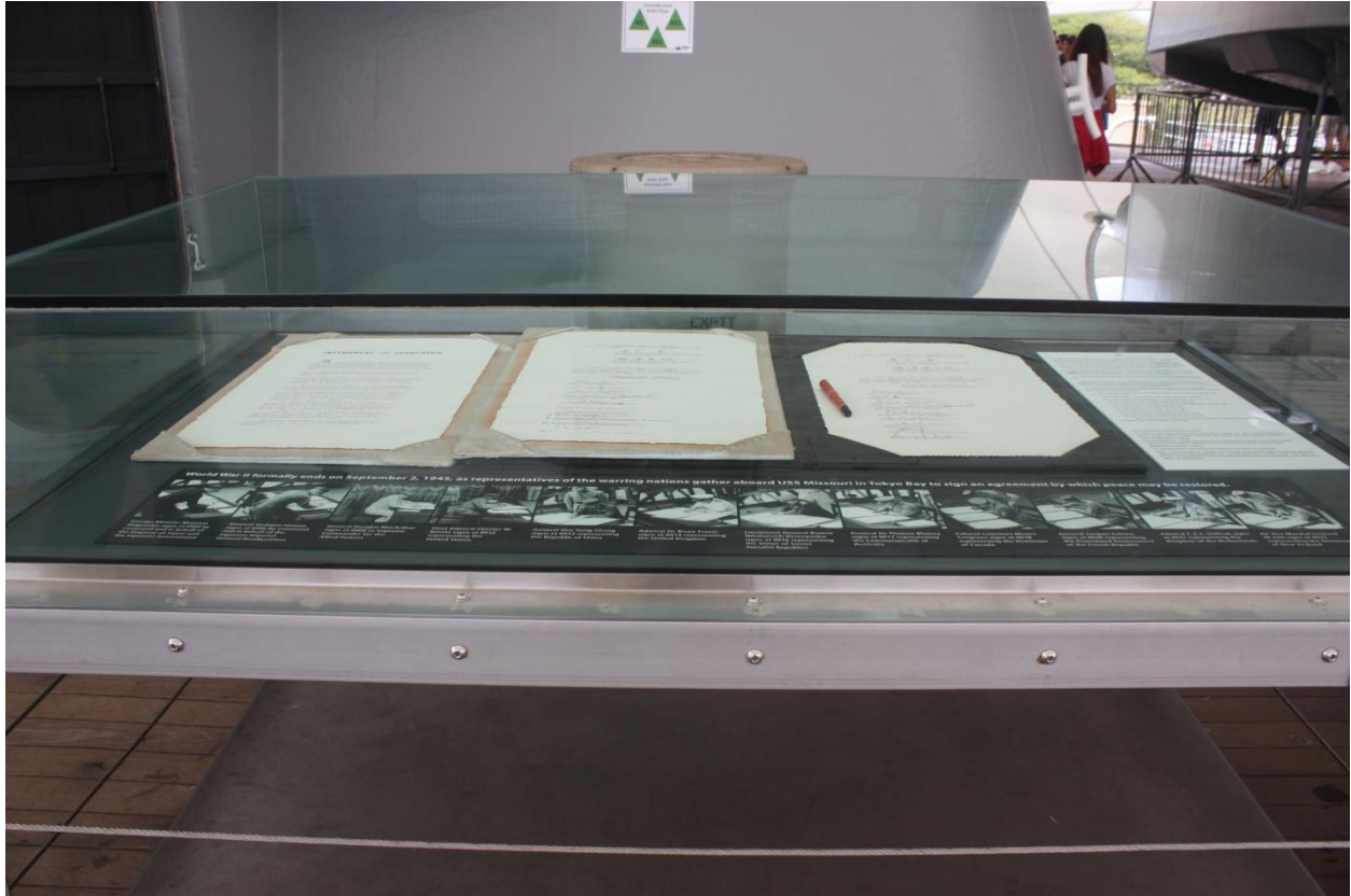
Surrender table display (Jeff Rand, 2018 September 2)