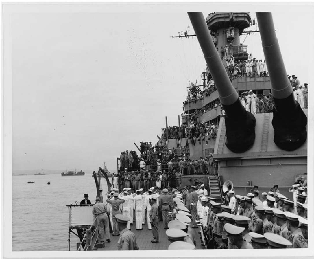
Japanese delegation arriving on the U.S.S. Missouri [Japanese foreign minister on left in top hat]

Eleven Japanese delegates arrived at 8:56 a.m. local time. General MacArthur and Admirals Chester Nimitz and William Halsey were at a table where the surrender documents were spread out. The ceremony began with a prayer, the playing of the "Star-Spangled Banner," and a short speech by MacArthur. 2 Japanese Foreign Minister Mamoru Shigemitsu and General Yoshiji Umezu signed the surrender document at 9:04 a.m. General MacArthur signed on behalf of the Allied Nations. 3 Standing just behind MacArthur were British General Arthur E. Percival and American General Jonathan M. Wainwright . Percival's British forces had been out-maneuvered and out-fought on the Malay Peninsula leading to the downfall of the British bastion at Singapore. Wainwright had taken over command of the doomed American and Filipino troops in the Philippines after MacArthur had been ordered to escape to Australia. Both had endured years of imprisonment by the Japanese. Representatives of other Allied nations signed for their countries, and the ceremony was over in just 23 minutes. 4 Hundreds, and by some accounts thousands, of American planes then flew over Tokyo Bay. 5