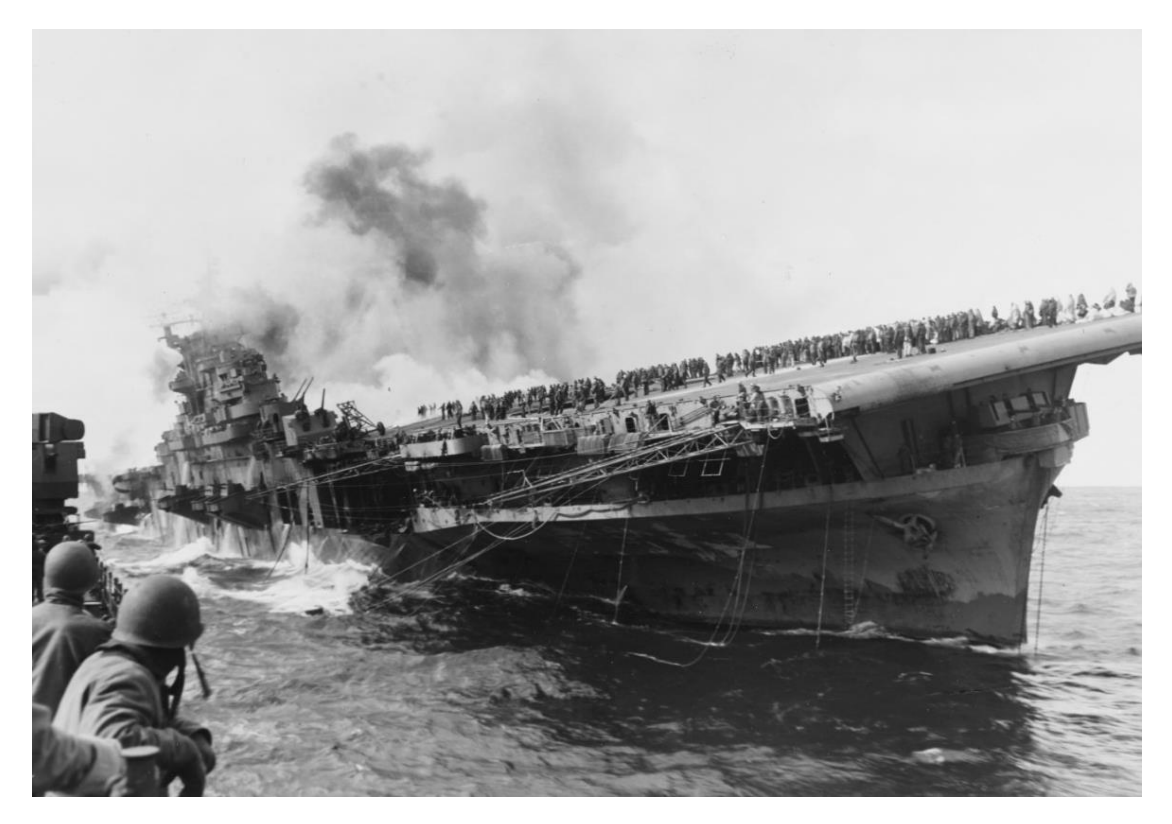
The stricken Franklin, as seen from a nearby ship

The fires and explosions went on for three hours. Finally, the fires were brought under control and another cruiser was able to tow the stricken ship out of the danger zone. By noon the next day, the Franklin was able to proceed under its own power to Ulithi. Those who saw the ship dock there could not believe it had stayed afloat. After preliminary repairs, it sailed back to the United States.<sup>34</sup> The war was over for "Big Ben."