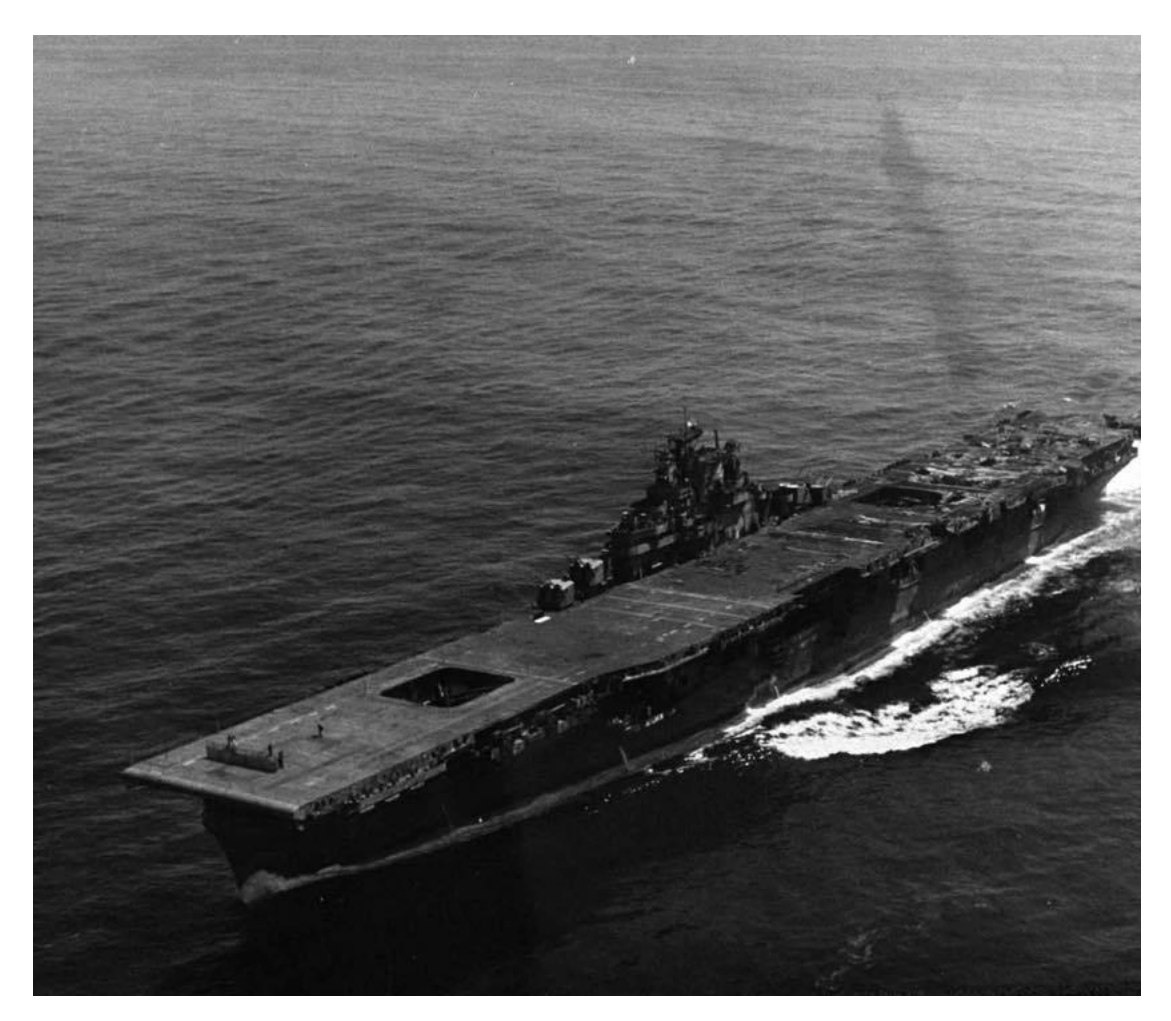
U.S.S. Franklin (CV-13)