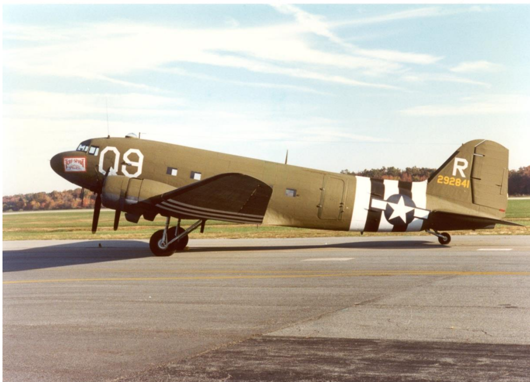
C-47A Skytrain (Air Mobility Command Museum)

On May 13, 1945, Colonel Peter Prossen flew a C-47 transport plane loaded with Army men and women on what was to be a three-hour sightseeing tour of Shangri-La. 7 Twenty-four people were on board: nine Army officers, nine members of the Women's Army Corps, and six enlisted men. 8