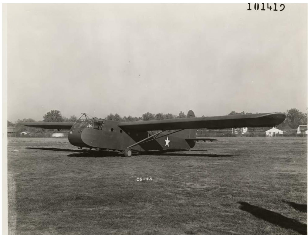
Waco glider (National Air and Space Museum)