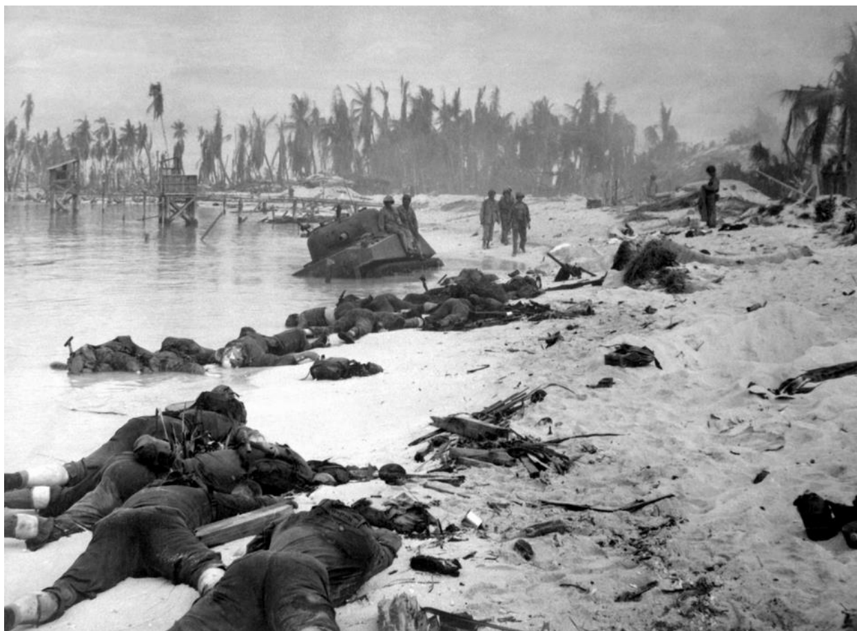
Marine dead on the beach at Tarawa

When correspondent Robert Sherrod landed at Tarawa after the fighting, he wrote that the "overwhelming smell of the dead hit me full in the face." When the tide came in, it carried along with it the bodies of Marines who had been killed in the water during the landing. Corpsmen waded in and pulled the remains up on the beach. It was a ghastly job after the bodies had been floating in the water in the tropical heat for a couple of days. The bodies were buried in a trench by a bulldozer. 6