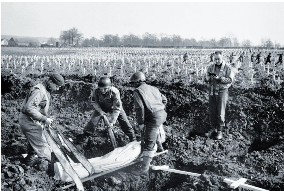
Burying the dead at Henri-Chapelle, Belgium, 1945 March 14

Battlefield conditions sometimes dictated that bodies were not recovered in a timely fashion. At the Anzio beachhead on the Italian coast, constant German shelling meant that many of the dead "rotted for months." 7