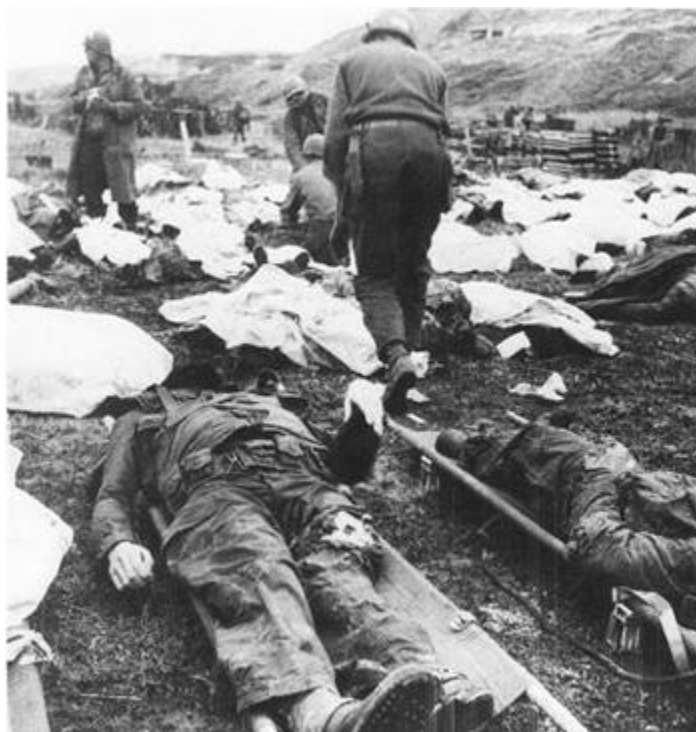
Graves Registration at work on Omaha Beach, 1944 June 7