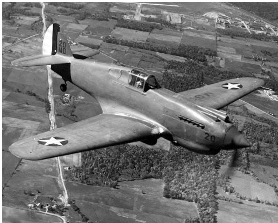
Curtiss P-40 Warhawk (Pacific War Online Encyclopedia)

When the Japanese made their surprise attack on Pearl Harbor on December 7, 1941, they were able to destroy many of the Army Air Corps P-40 fighter planes at their airbases in Hawaii. The Americans had parked them wingtip to wingtip to make them easier to guard against sabotage. Only a few were able to get airborne and oppose the Japanese air raid that brought the United States into World War II.