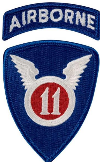
11th Airborne Division patch