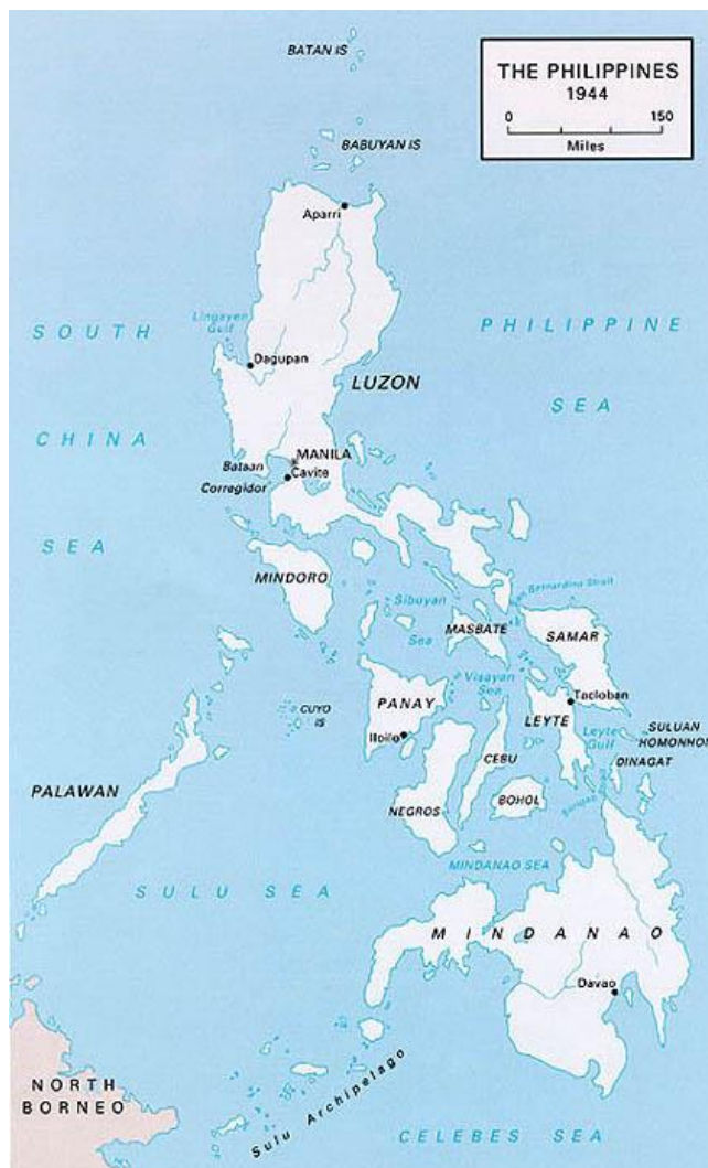
The Philippines

Meanwhile, American and Filipino troops under General Douglas MacArthur carried out a valiant but doomed defense of Luzon and the island of Corregidor for several months. President Roosevelt ordered MacArthur to escape to Australia. On April 9, 1942, the 78,000 defenders of the Bataan peninsula, weakened by hunger and disease, surrendered to the Japanese. Another 13,000 Americans and Filipinos held out on Corregidor until May 6 until they too were ordered to surrender. The Japanese now controlled the Philippine Islands, as well as thousands of military and civilian prisoners taken in the campaign. 9