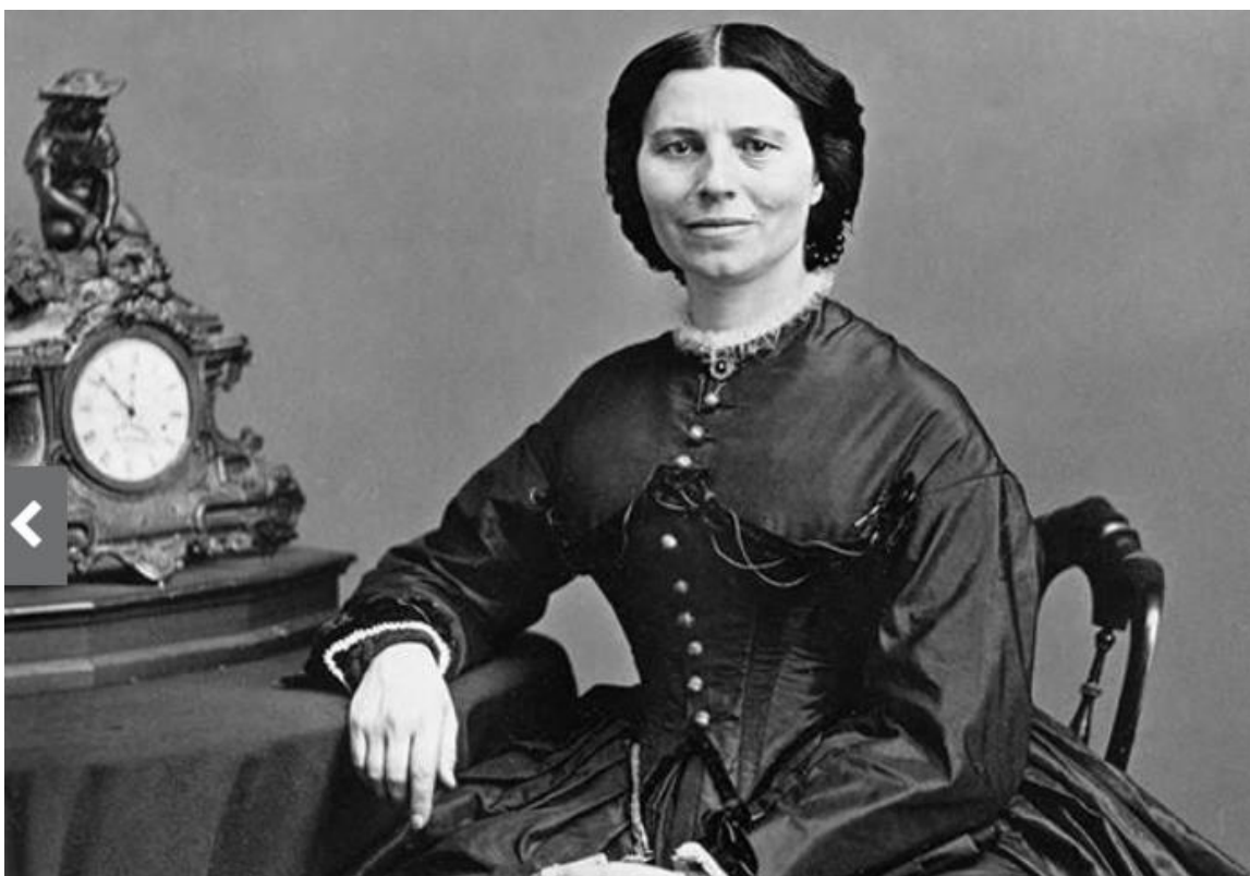
Clara Barton

The American Red Cross had been established by Clara Barton in 1881. A volunteer nurse during the Civil War, Barton traveled to Europe after the war where she learned of the Red Cross in Switzerland. Barton returned intent on establishing the organization in the United States. She served as first president of the American Red Cross for 23 years. 5