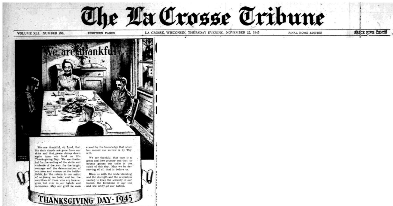
(La Crosse Tribune, 1945 November 22, page 1)

Thanksgiving Day 1945 was the first one for several years not celebrated under the clouds of war.