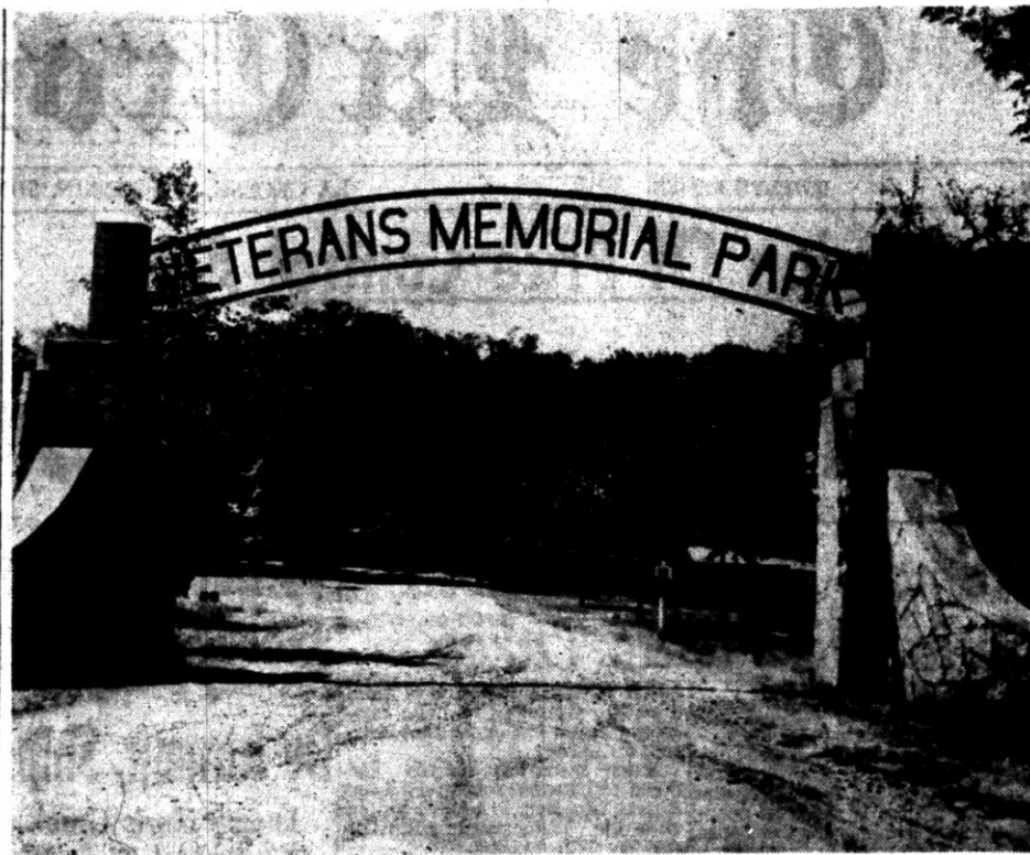
A New Archway Has Been Built for Veterans' Memorial park, formerly Waterloo, on U. S. highway No. 16 near West Salem. The park will be dedicated by the county board of supervisors at exercises today.