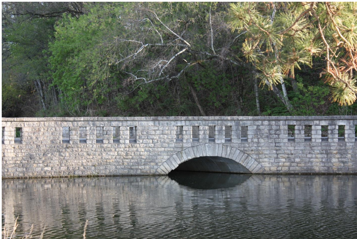
The bridge at Veterans' Memorial Park, West Salem, Wisconsin