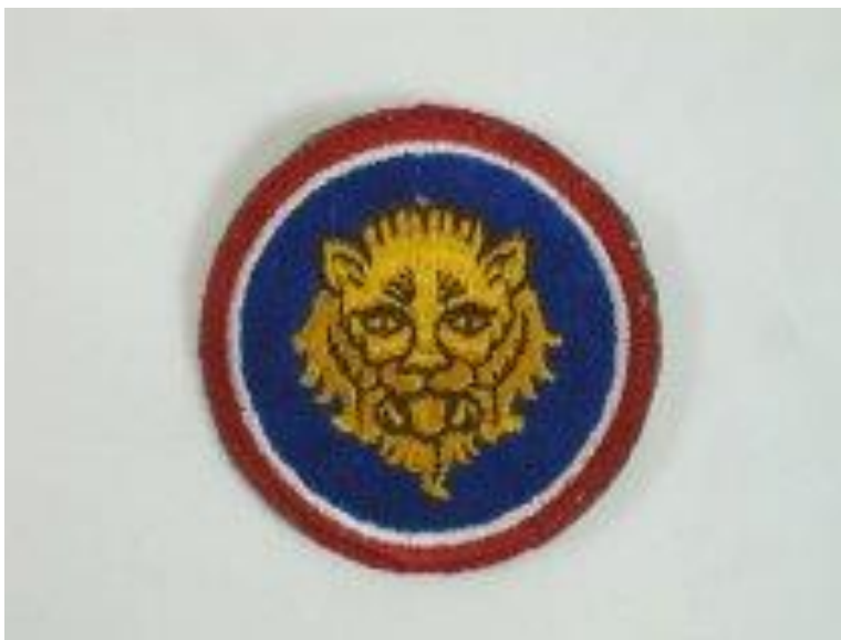
Shoulder patch of the 106 th "Golden Lions" Infantry Division