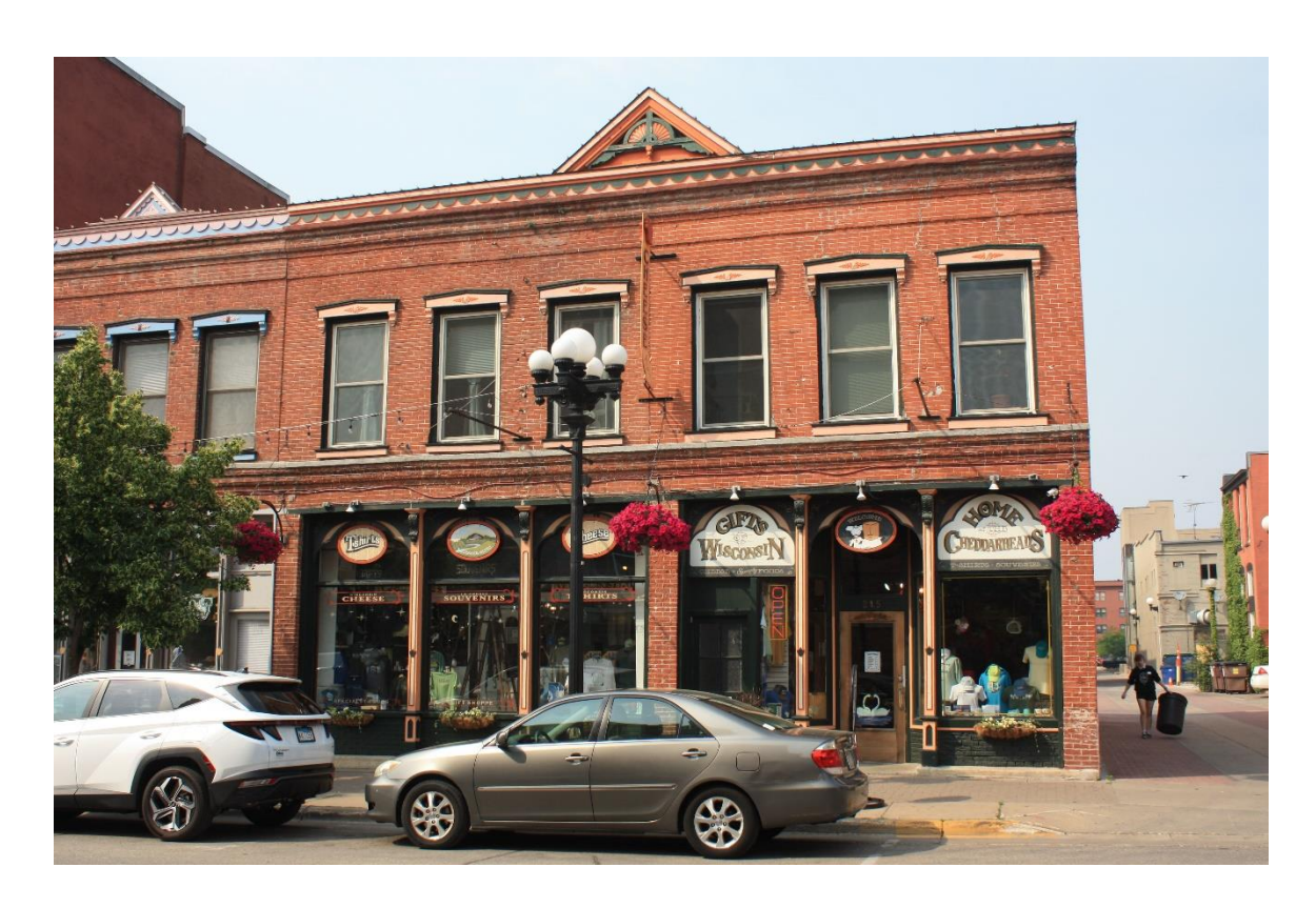
213-215 Pearl Street as it appears today

DeWood's grandparents operated a business at, and lived above, 215 Pearl Street Her cousin operated a tavern at 213 Pearl Street