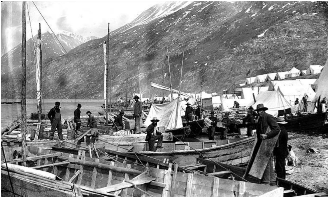
Klondikers embarking at Lake Bennett on 1898 June 1, photo by Eric A. Hegg

By late September 1897, Wells wrote that there were 6,000 to 8,000 men working 1,200 gold claims in the Klondike country. He said 2,000 more men were enroute along the Yukon River. 44 Most of the prospective Klondikers were too late in the season to reach Dawson City before winter set in and the lakes and rivers froze. They camped out for the winter all along the route, including about 10,000 people in a tent city on the shores of Lake Bennett. When the lake finally thawed at the end of May 1898, about 20,000 people using a motley fleet of more than 7,000 boats constructed on the spot pushed on toward the gold fields using lakes and rivers as their highway and portaging the land barriers. 45