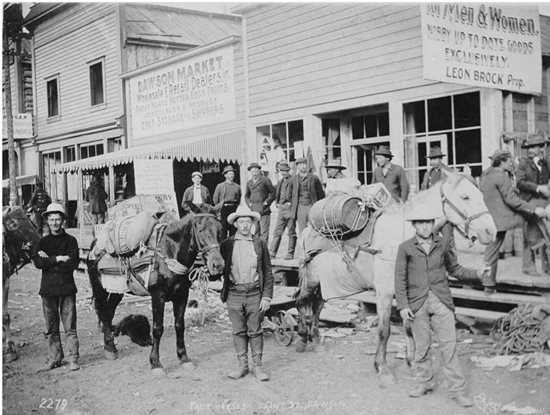
Pack horses in front of the Dawson Market, June 1898