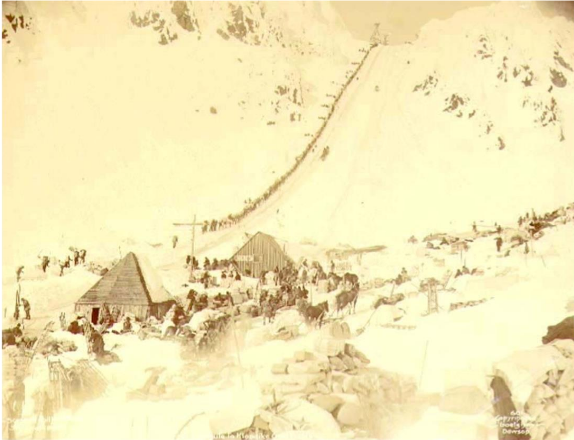
An ant-like procession of Klondikers ascends the Chilkoot Pass in the spring of 1898