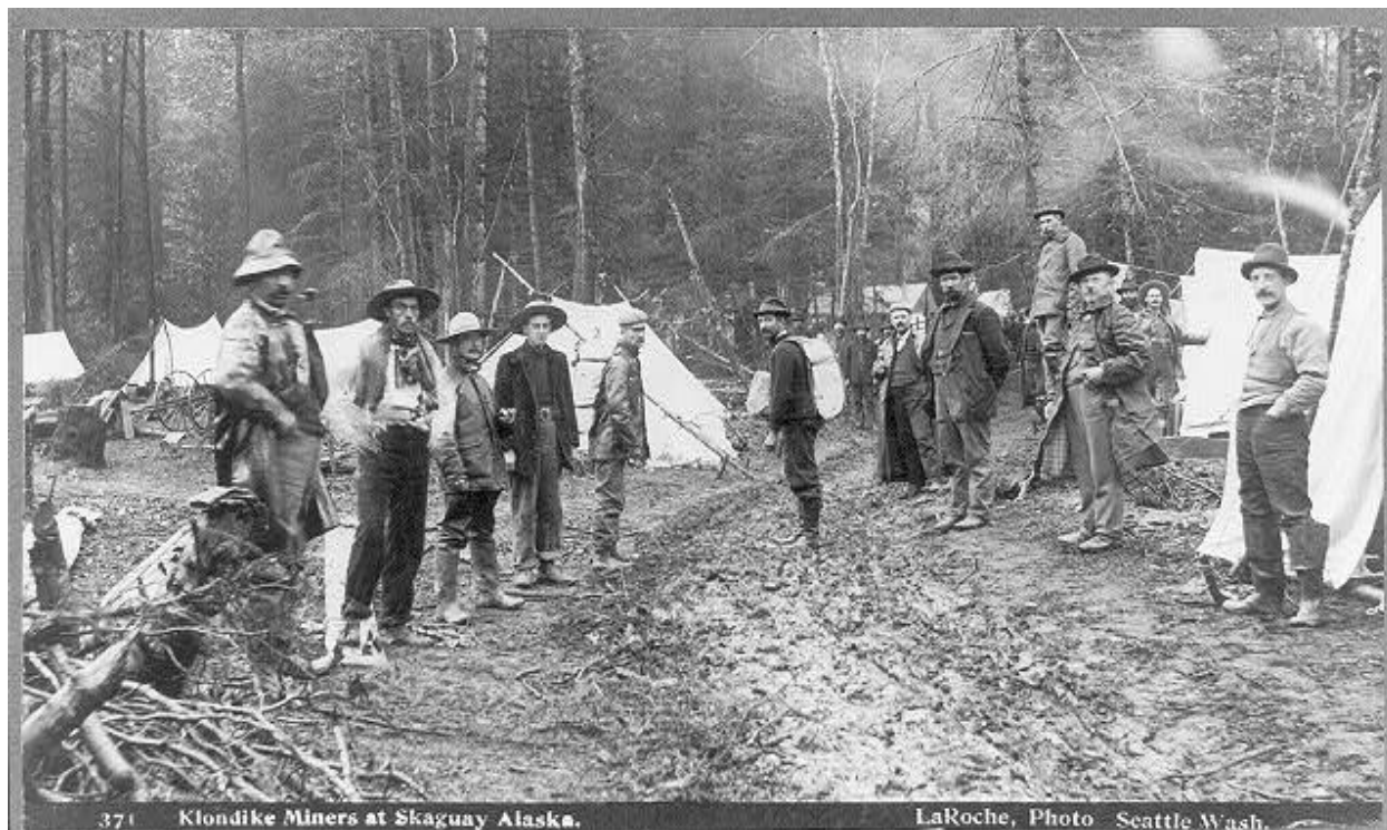
Klondike miners at Skagway, Alaska, in 1897

their passengers and supplies. 28 Some ships could not even return because their crews deserted to join the gold prospectors. 29