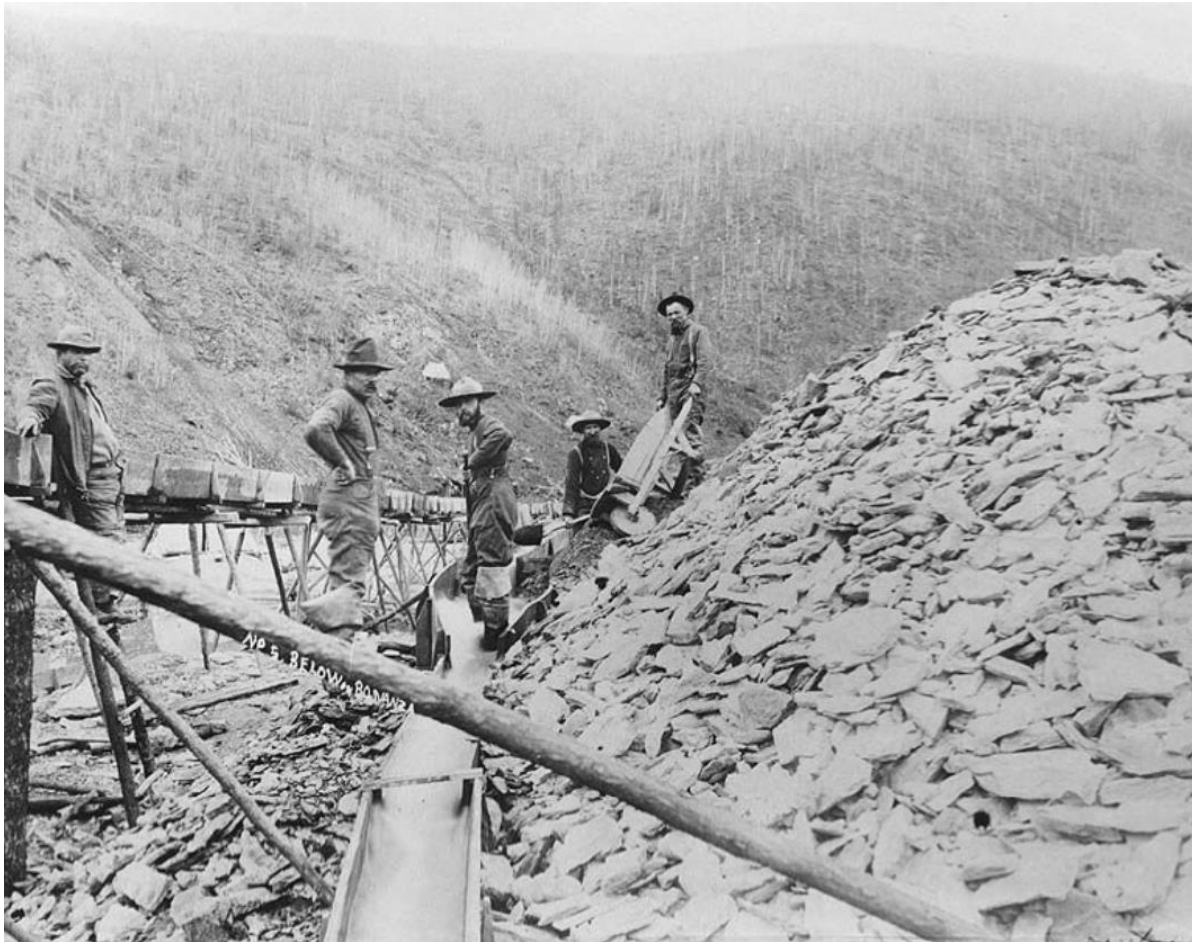
Mining operation, No. 5 below Bonanza Creek, 1898 ca., photo by Eric A. Hegg