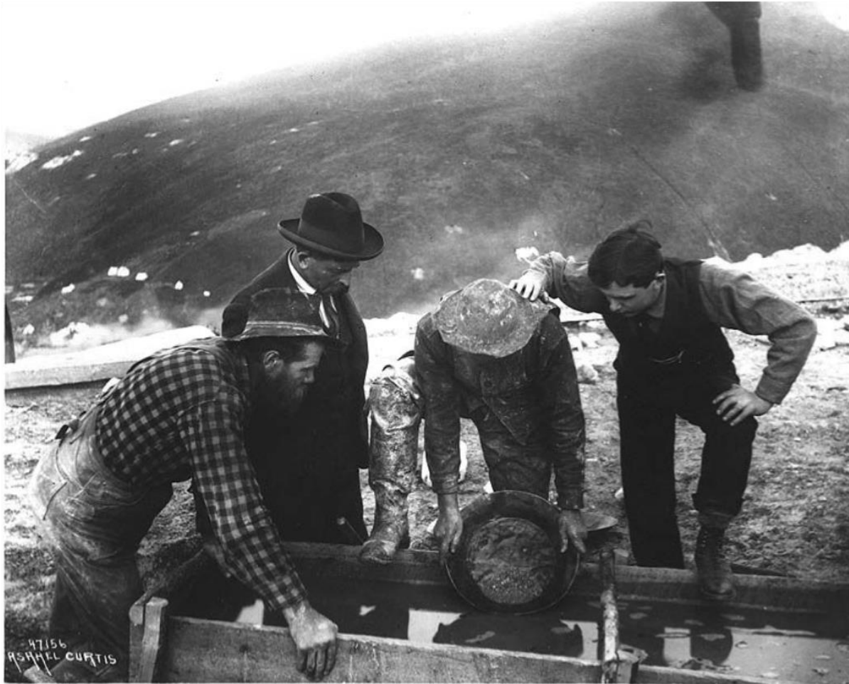
Panning for gold in a sluice box, Bonanza Creek, 1899

separate out gold on a larger scale. Miners also dug horizontal tunnels and vertical shafts in the ground to reach gold deposits in the bedrock. 40