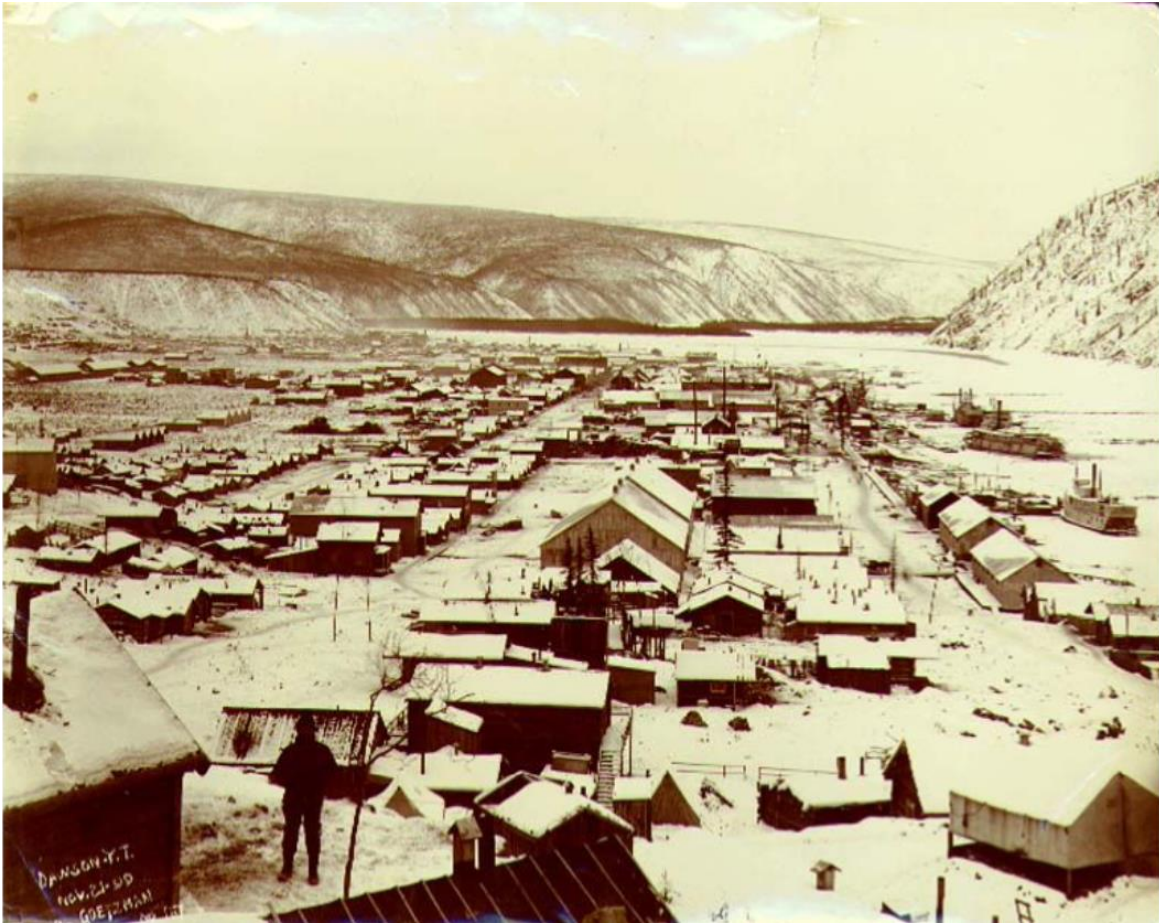
Dawson City on 1899 November 21

Note the three steamers frozen in the river on the right.