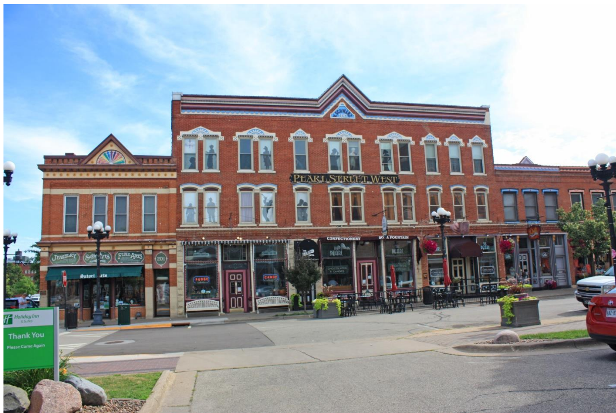
Looking north at the same building on the west end of Pearl Street.