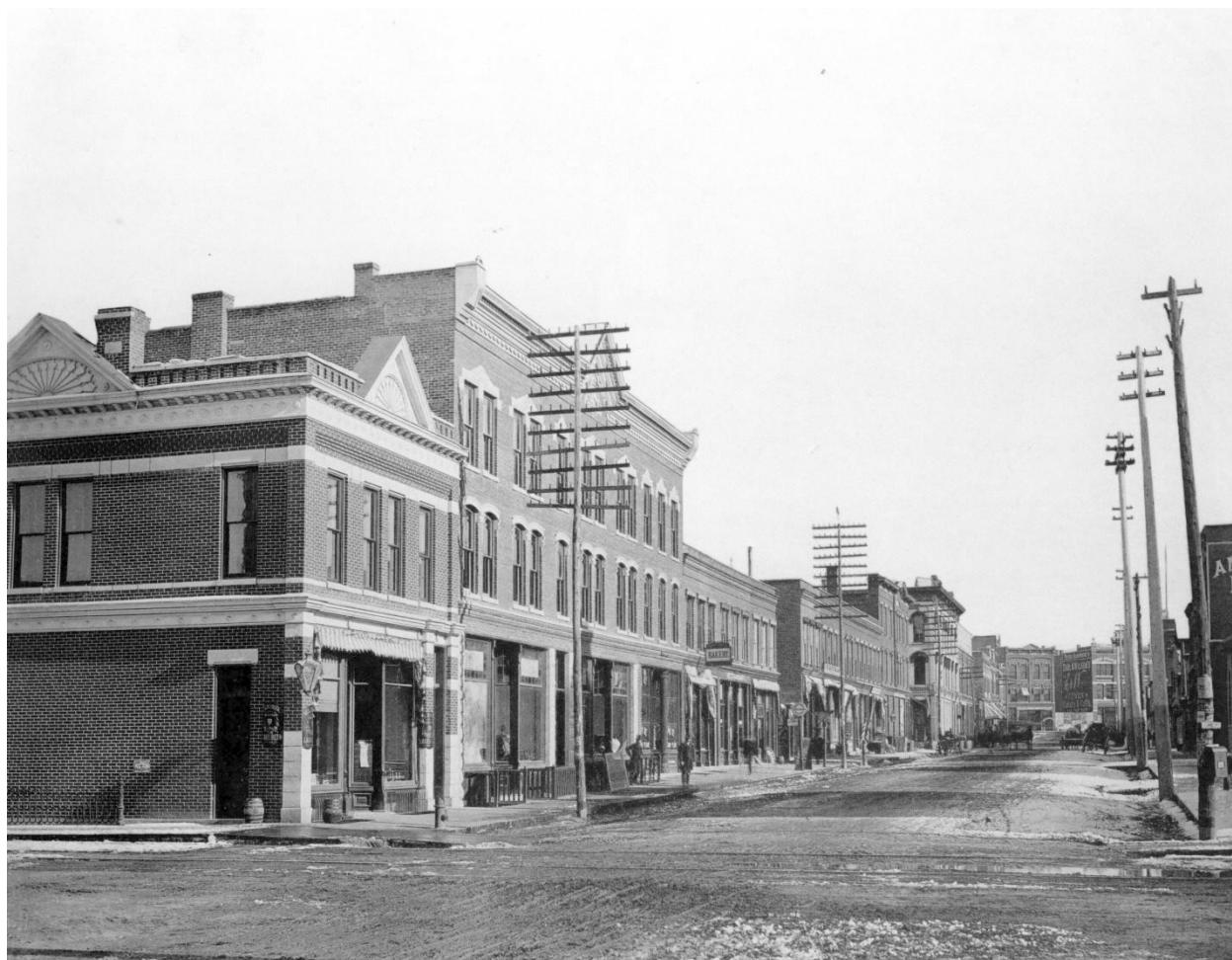
West end of Pearl Street, looking east, in 1897.