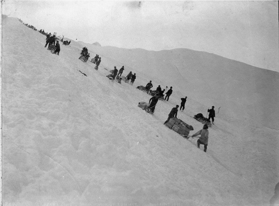
Klondikers hauling supplies up the Chilkoot Summit, 1898

The 45-degree slope was not trick photography.