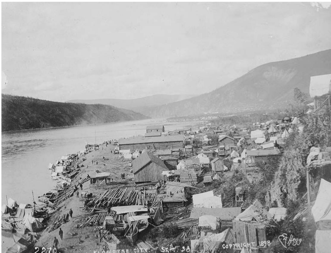
Klondike City on the Yukon River, 1898 September

This was across the river from Dawson City.