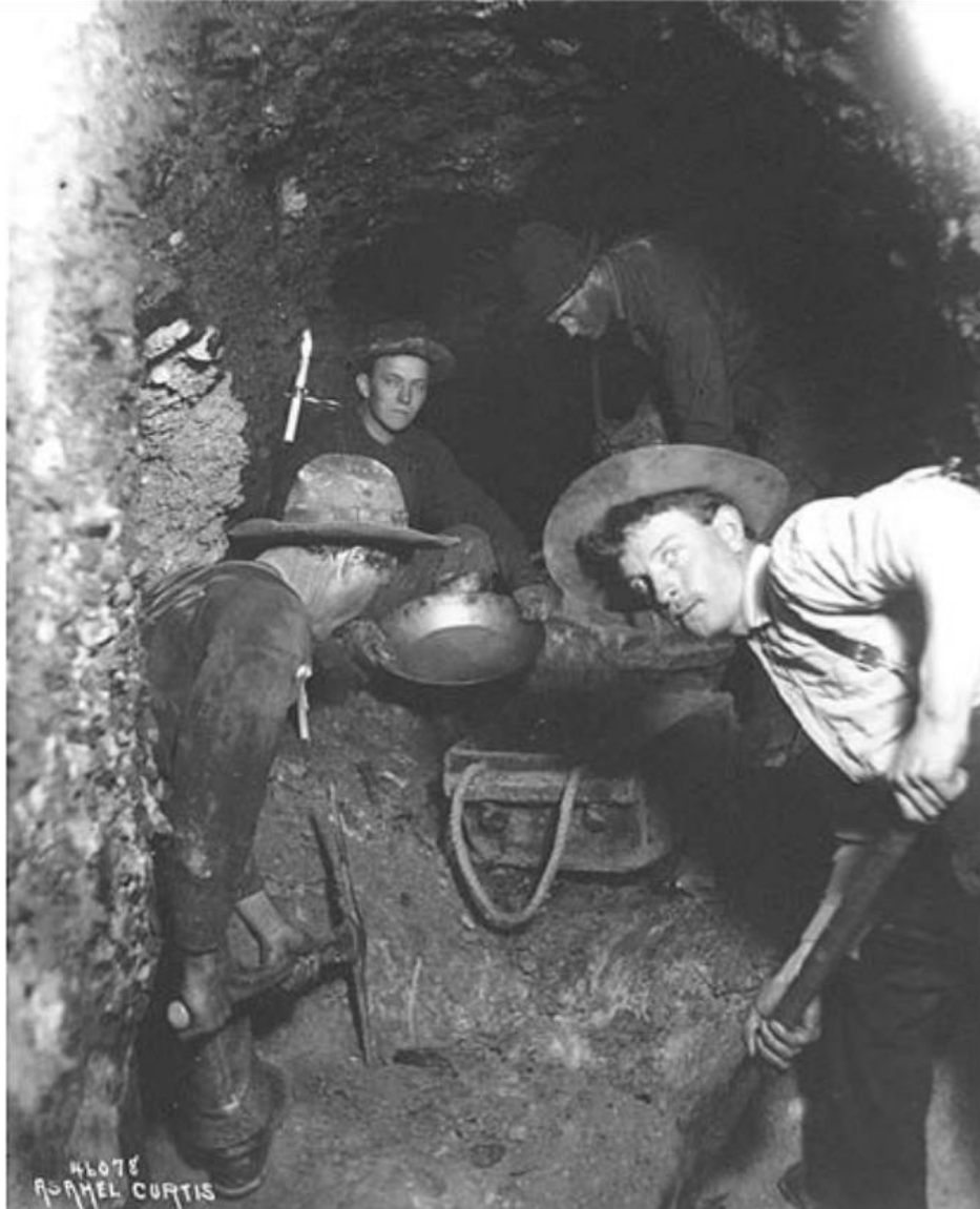
Underground mining in the Yukon territory, 1898, photo by Asahel Curtis