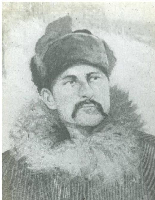
George W. Carmack

In August 1896, a Canadian, Robert Henderson, and an American, George Washington Carmack, independently found gold on branches of the Klondike River in the Yukon region of northwest Canada. Carmack bragged about his discovery, and soon dozens of prospectors flocked to the area to try their luck. 16