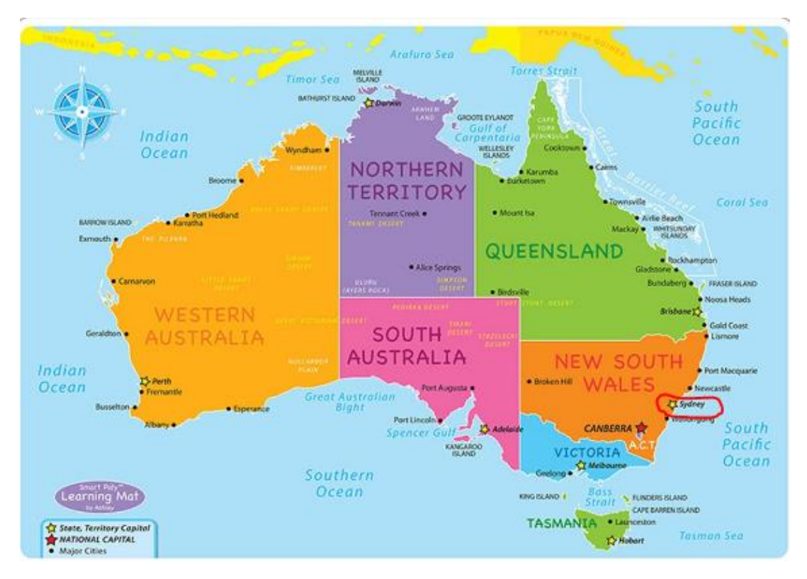
Map of Australia; Sydney circled in lower right