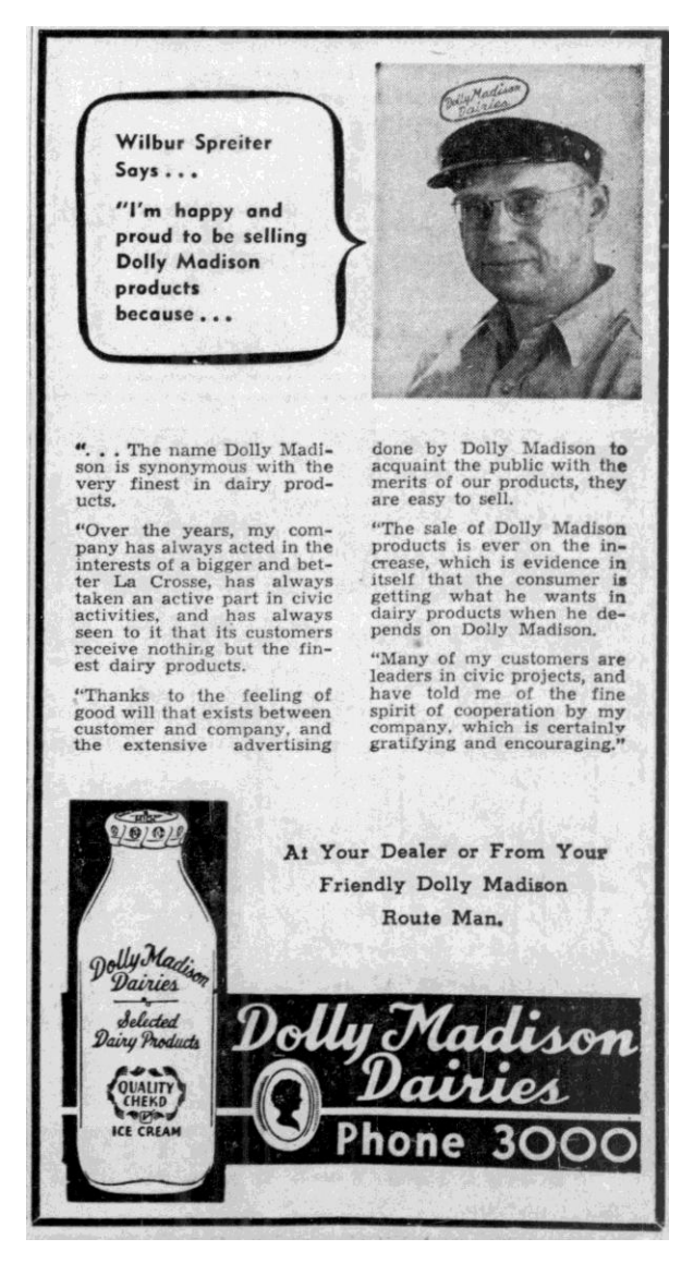
(La Crosse Tribune, 1949 June 19, page 8)