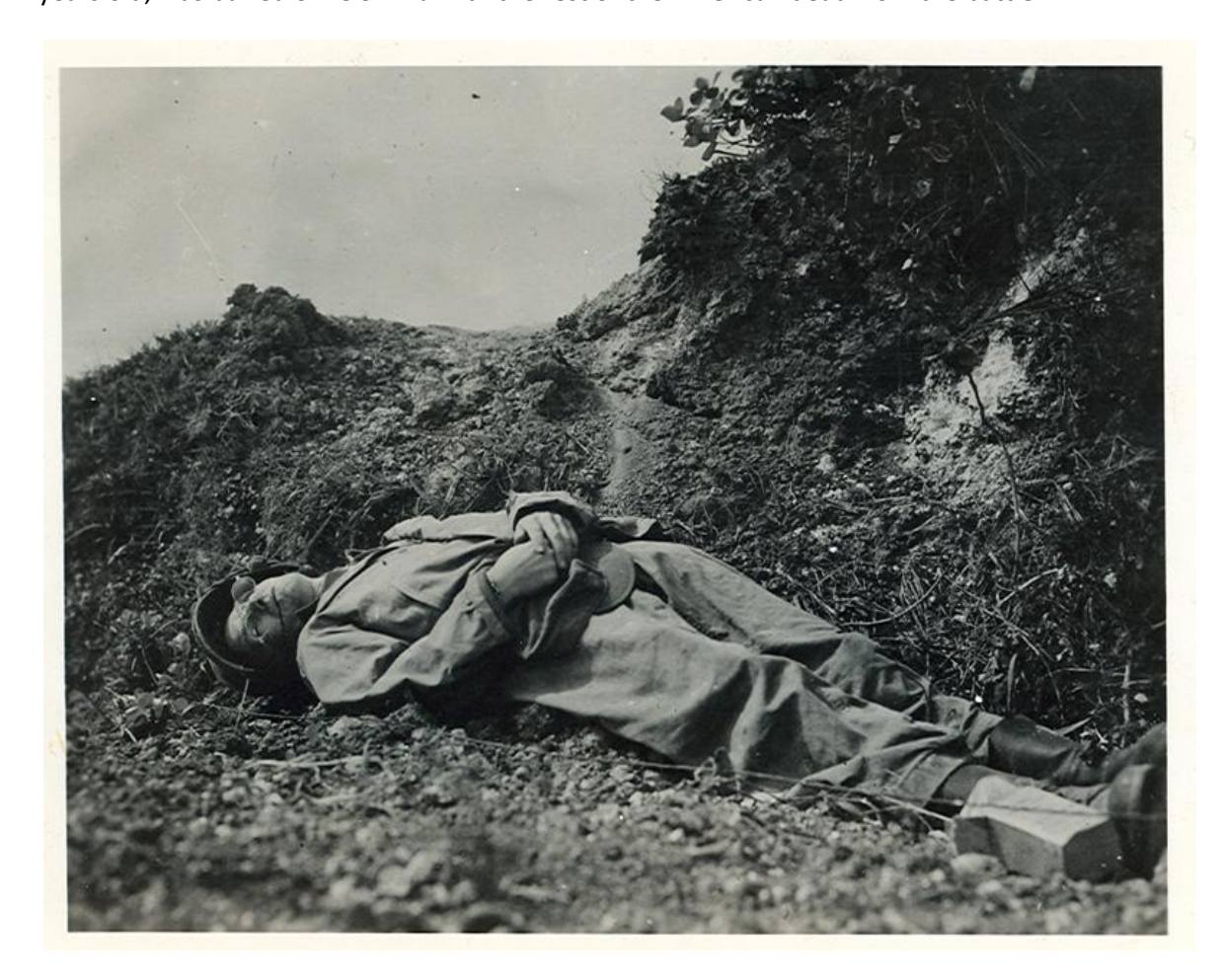
Ernie Pyle's body at the spot where he was killed, 1945 April 18

out into the ditches beside the road. When Pyle stuck his head up to see if anyone had been hit, a second burst from the machine gun put a bullet in his left temple and killed him instantly. Ernie Pyle, just 44 years old, was buried on le Shima with the rest of the American dead from the battle.<sup>2</sup>