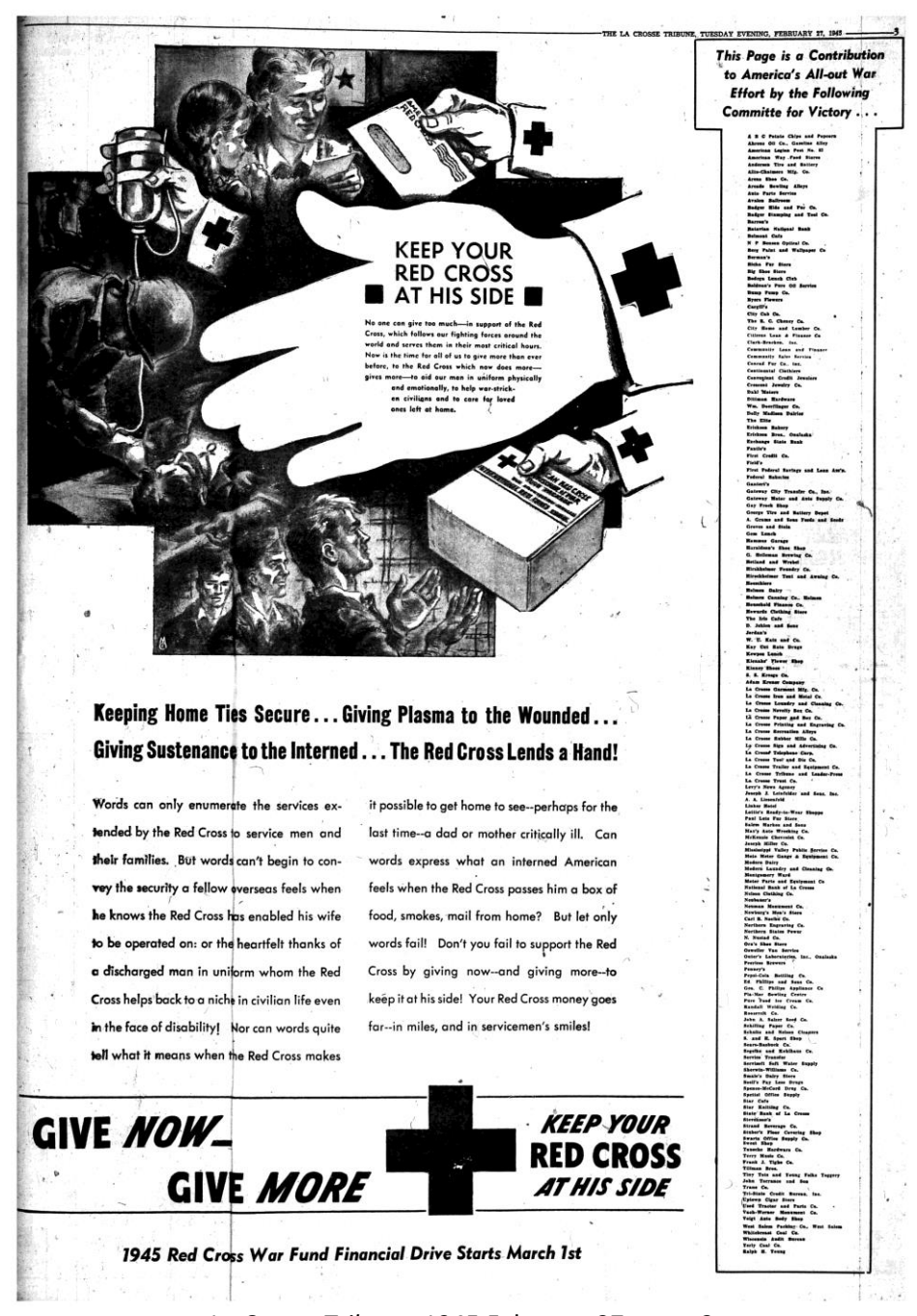
La Crosse Tribune, 1945 February 27, page 3

The local Committee for Victory ran advertisements every week for various war causes. This week they are promoting the Red Cross War Fund drive.