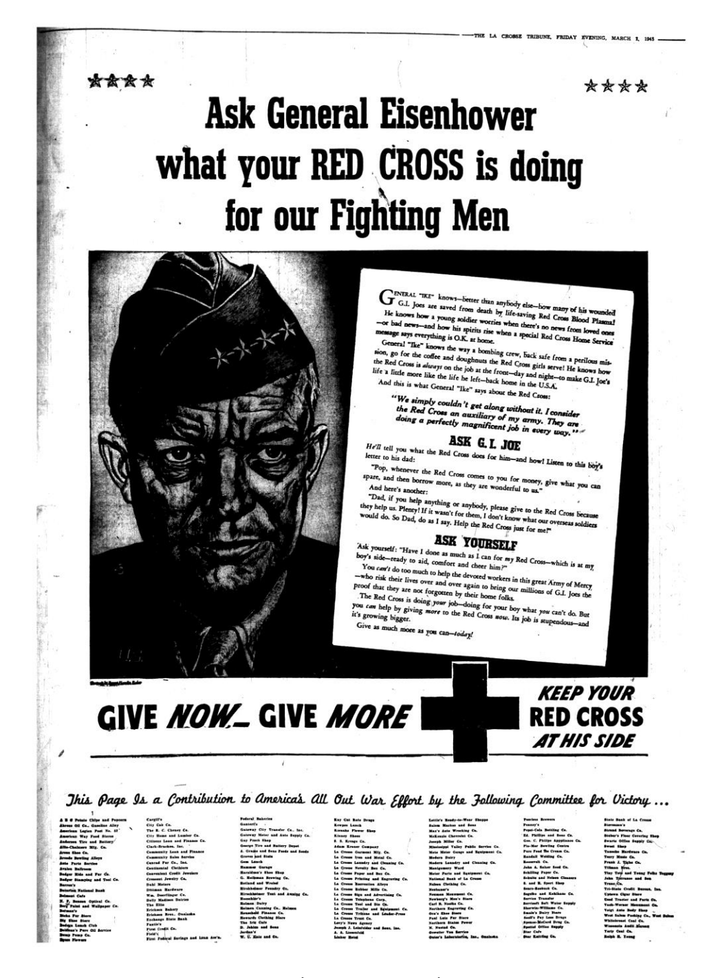
La Crosse Tribune, 1945 March 2, page 3

By 1945, the American Red Cross had 39,000 paid staff and coordinated 7.5 million volunteers. They provided services to 16 million servicemen during World War II. The Red Cross personnel provided relief supplies to civilians, operated clubs for servicemen, and were attached to medical facilities. They sent care packages to servicemen, including prisoners of war in Germany. At home, they provided civil defense and safety training.<sup>6</sup>