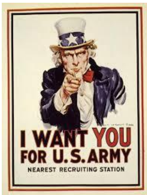
U.S. Army recruiting poster

The " Uncle Sam" recruiting poster had been around since World War I. With another world war raging, Uncle Sam needed men, a lot of men. Patriotic fervor generated by the Japanese attack on Pearl Harbor caused a surge in enlistments in the armed forces, but that alone was not enough for the task ahead. Eleven out of every twelve American men who served in the armed forces during World War II were "drafted" under the Selective Service system. 1