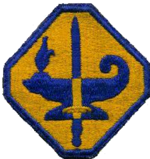
Shoulder patch of the ASTP

In the middle of 1943, the War Department announced the creation of the Army Specialized Training Reserve Program. Male volunteers between the ages of 17 and 18 took tests to qualify for the 25,000 available scholarships in the program. There would be no military training until the student turned 18. At the end of that school term, the student would be placed on active military duty for basic training. Then he would enter the Army Specialized Training Program (ASTP). 1