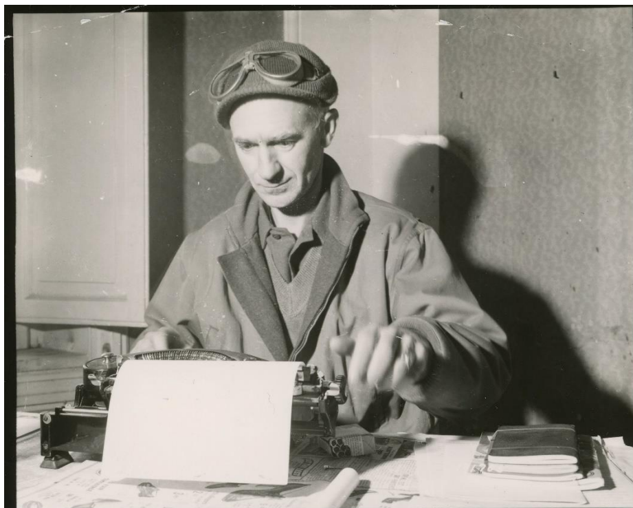
Ernie Pyle writing a story on his typewriter

Pyle's columns appeared in about 400 daily and 300 weekly newspapers, making him "America's most widely read correspondent." 16