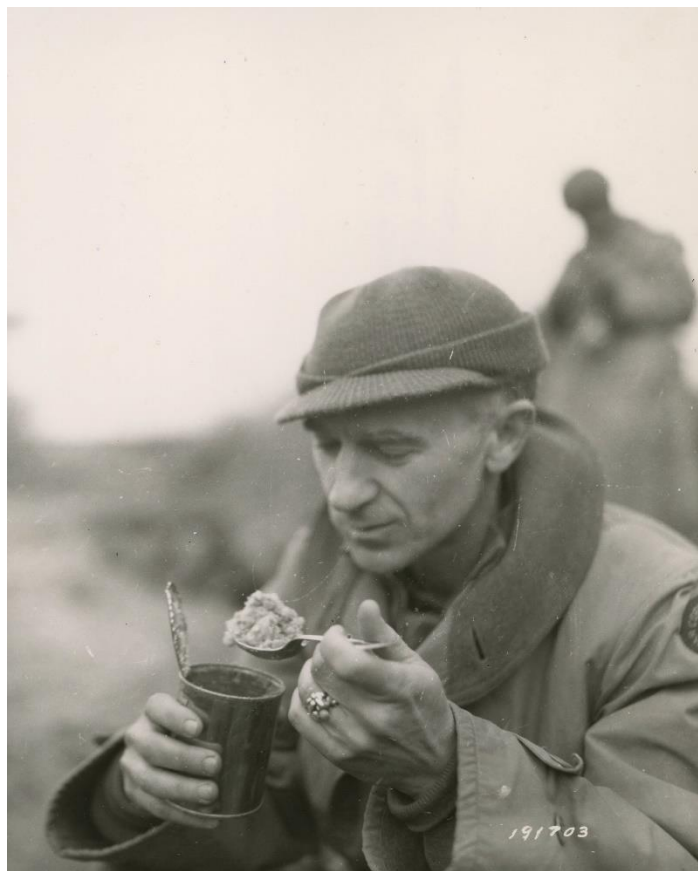
Ernie Pyle eating C-rations

He went with the Army for the invasion of Sicily in 1943. His work had already been published in a book entitled Here Is Your War: The Story of G.I. Joe . When the campaign in Sicily ended, Pyle went back to the United States to do publicity appearances for the book. 10