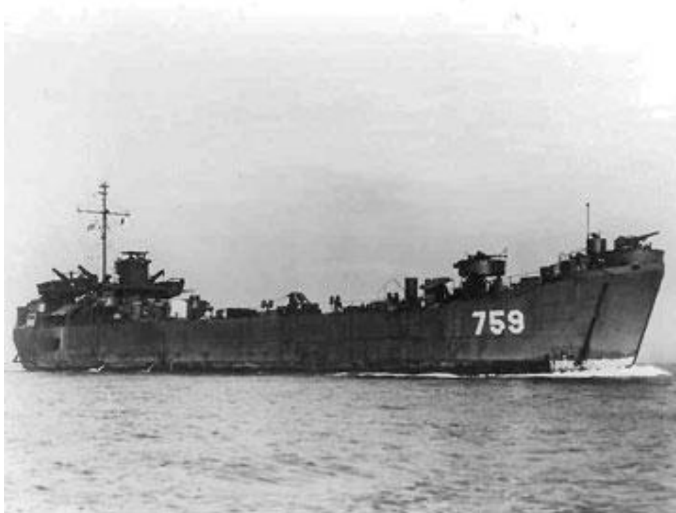
A Landing Ship, Tank during World War II