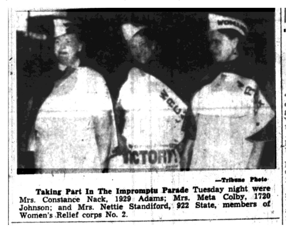
(La Crosse Tribune, 1945 August 15, page 2)

The Veterans of Foreign Wars drum and bugle corps took to the streets of La Crosse that evening for impromptu parades with crowds of people. The La Crosse Tribune appealed for a more organized parade to gather at Fourth and Main streets at 2:00 p.m. on Wednesday.<sup>6</sup>